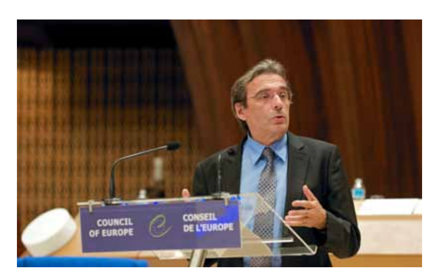
Roland Ries, Senator Mayor of Strasbourg