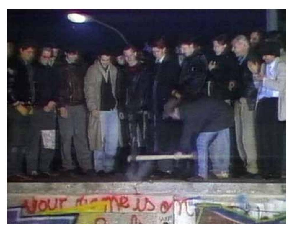
Berlin Wall, November 1989