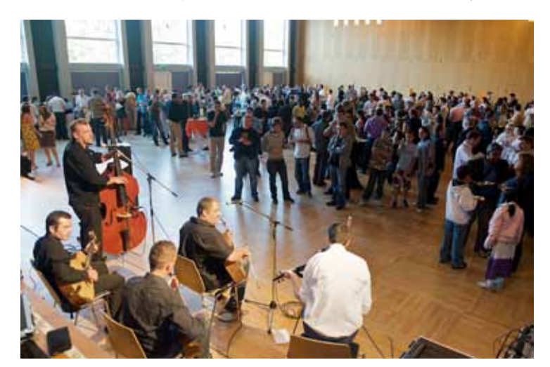
Party at the City hall in Kehl