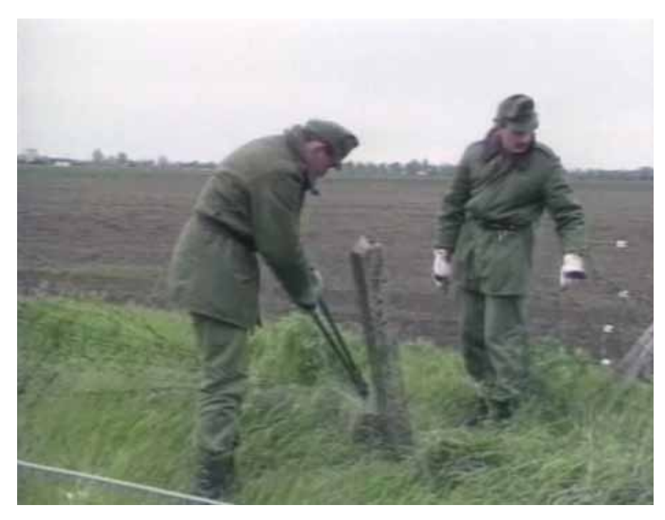
Dismantling of barbed wire, Hungary