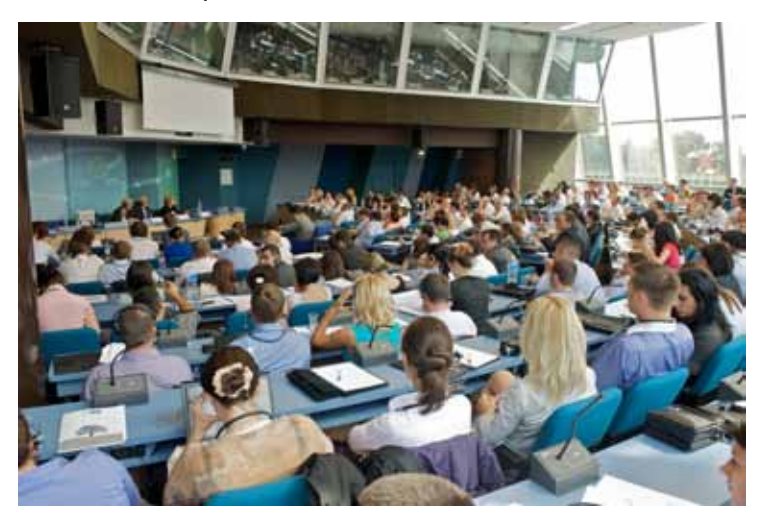
Participants of the Summer University during a conference