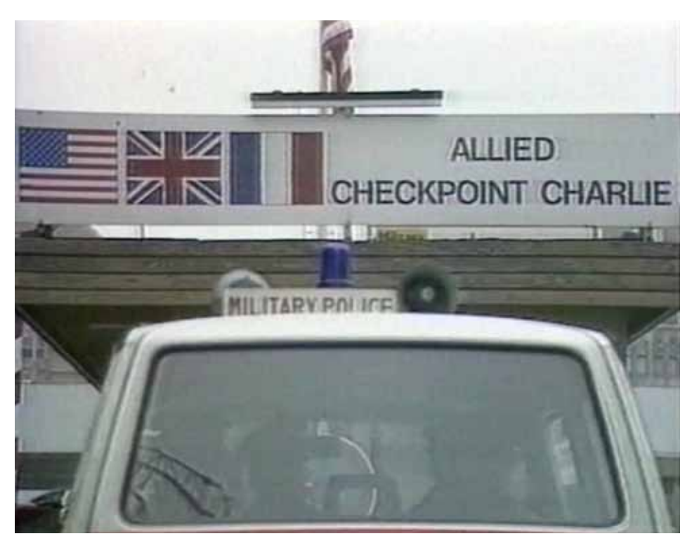
Checkpoint Charlie, Berlin