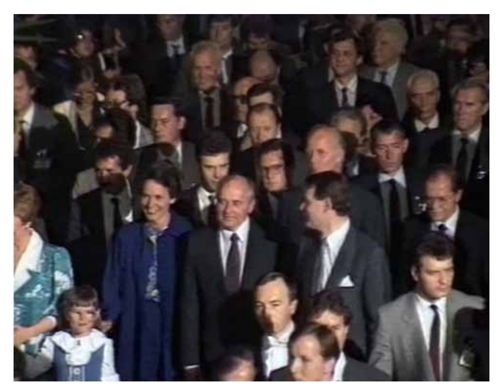
Mikhail Gorvatchev's official visit of the Council of Europe, 6 July 1989