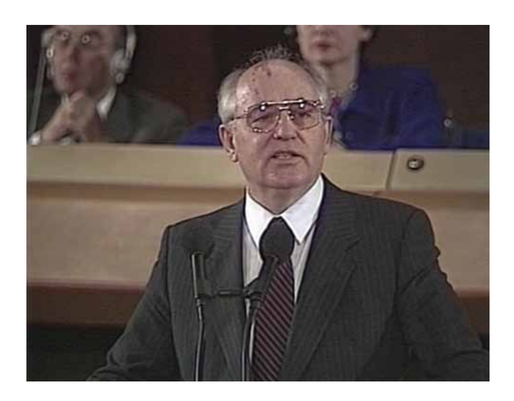
Mikhail Gorbatchev's speech to the Parliamentary Assembly of the Council of Europe, 6 July 1989