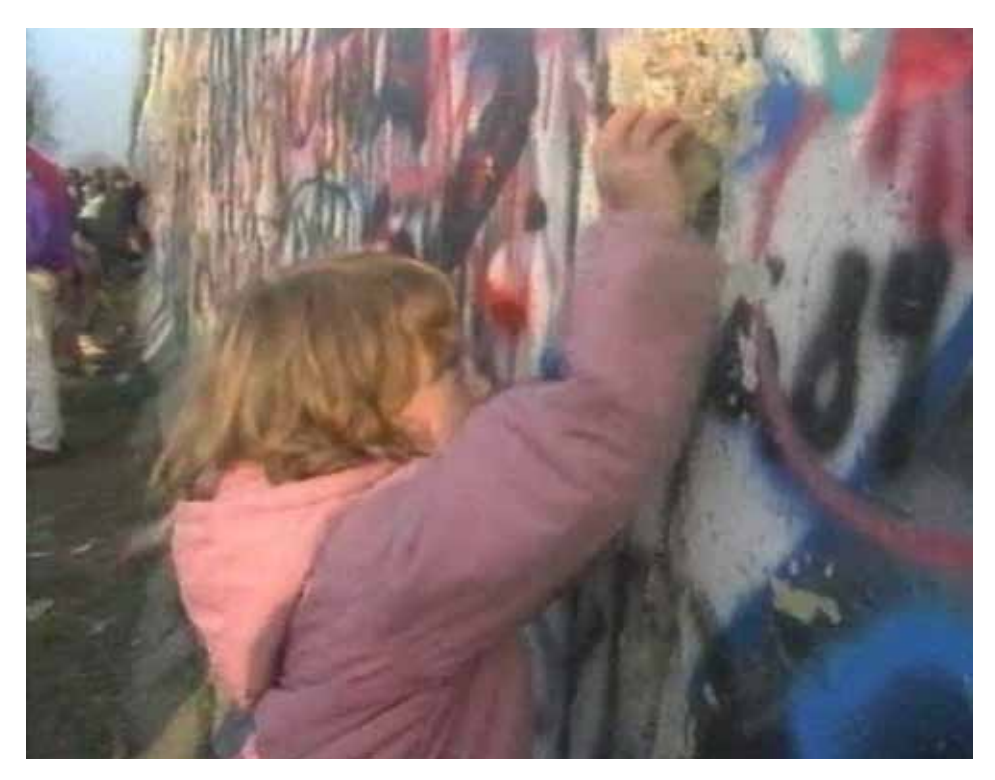
Berlin Wall, November 1989