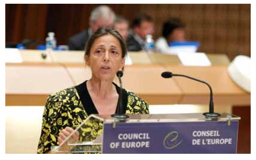
Luisella Pavan-Woolfe, Permanent Representative of the European Commission to the Council of Europe