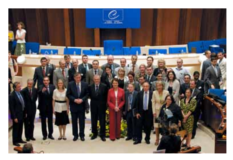
Opening session, group photo of the Directors of the Schools and guest speakers