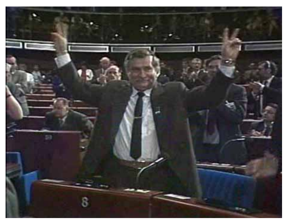
Lech Walesa at the Council of Europe