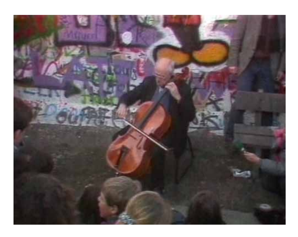
Impromptu concert by Mstislav Rostropovich during the fall of the Berlin Wall